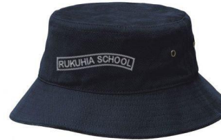
Rukuhia Brim Bucket Hat $42

Logo U2 are now able to offer your school uniform to be ordered directly from their online shop www.logou2.com