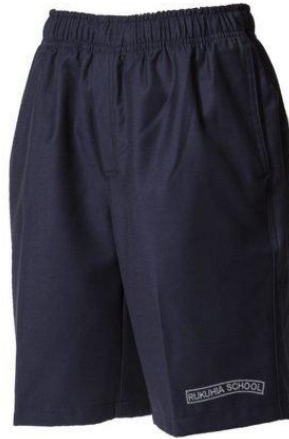
Rukuhia School Shorts $42