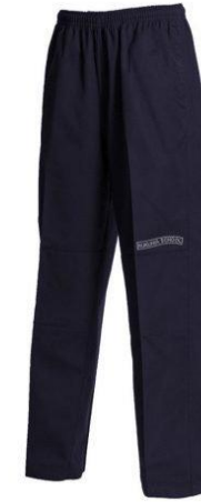
Rukuhia School Pants $45