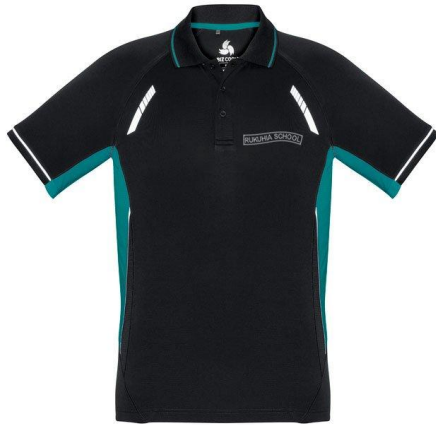
Rukuhia School Polo $37