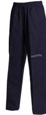
Rukuhia School Pants $45