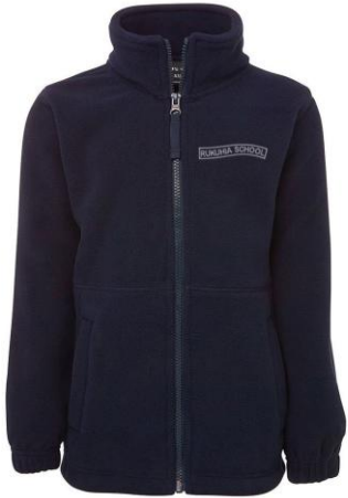
Rukuhia School Full Zip Polar $42