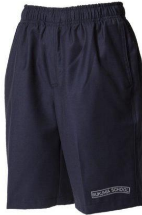
Rukuhia School Shorts $42