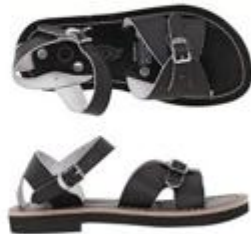
Classic School Sandal