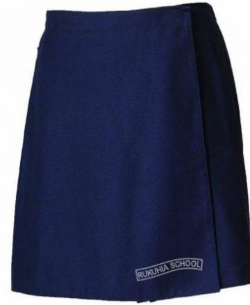
Rukuhia School Skort $42